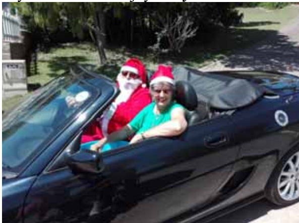
Father Christmas and Lady Elf in a MG – guess who??