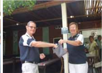
Waiting in comfortable anticipation for the famous Zucchini breakfast and the lucky draw