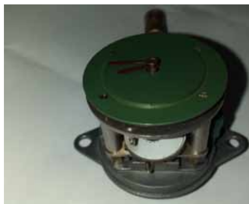
Clock in a classic Smith Jaeger Rev. Counter Clock removed showing white balance wheel

The actual clock movement is extremely well made and withstands the test of time remarkably well. It is the pin function that fails, but a company in the UK manufactures an electronic module to replace the pin and contact bit which can be fitted with a reasonable amount of dexterity. The screws are very small and fat fingers need to be quite nimble to manage it, but it can be done. This kit is available from Clocks4classics.