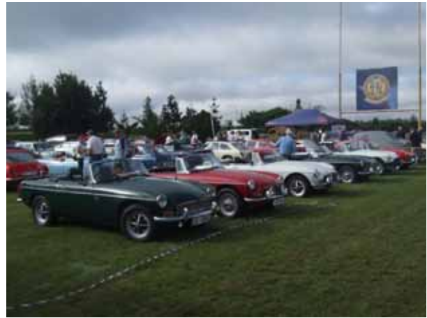
MGCC South Cape proudly on display at the 2020 George Old Car Show