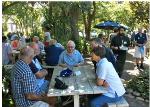
Above: This is your life. Do what you love and do it often. If you don't like something, change it. Stop over analysing. Life is simple. Open your mind, arms and heart to new things and people.