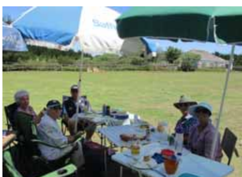
Competitors charging batteries before

A small but enthusiastic group gathered by the two cricket pitches behind Totties on 17 th February to take part in the Forever Young Games and Picnic.