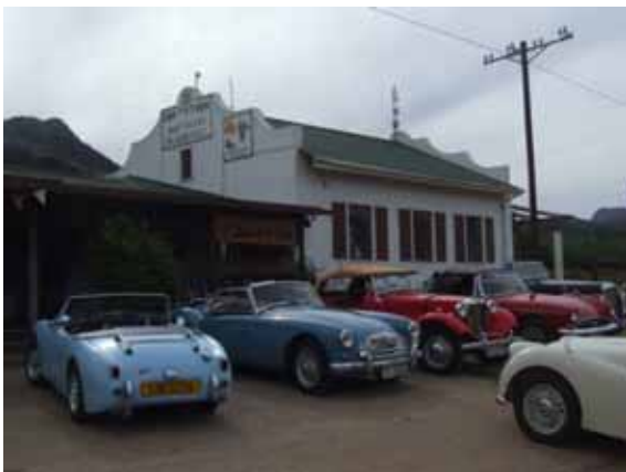
Catholic selection of cars en route