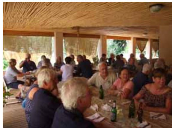
With plenty of eating on arrival