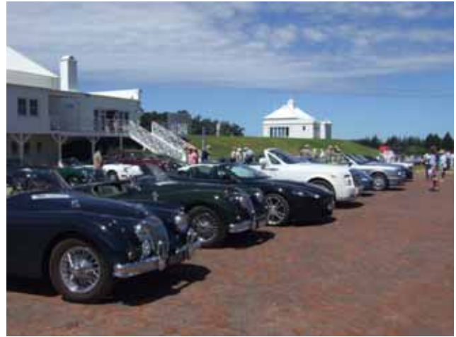
MG line-up at the Kurland Polo Club - & our visitors - Note the huge white Rolls convertible