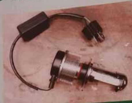
New LED Lamp