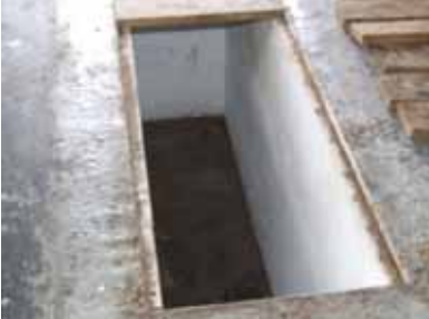
Completed pit – cover-planking to the side

In practice, the silly central location of the pit is not much of a hassle as it is very easy to roll an MG back and forth as needed while standing in the pit. Head bumping too has been minimised but using a short step ladder as a seat while working and also using it as access steps which I have never bothered to construct. The stout hatch is made of individual, numbered cross-pieces of planking. These look good and are easy to remove, one at a time, to expose as much of the pit as is needed