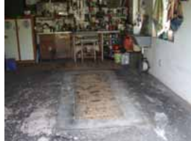
Covered pit in the "incorrect" centre of garage