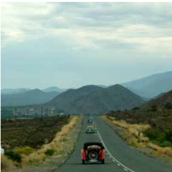
The Road Home