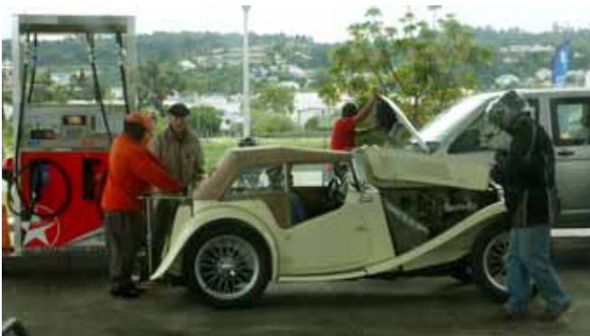
The beginning of a great few days.