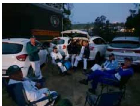
Super Car being kept under control A well earned rest break at the end.