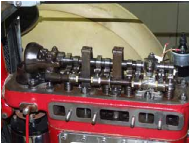
Overhead cam of an M's engine (not Bruce's)

Apart from its light-weight body and advanced for its day running gear, it is the innovative overhead cam, 850cc engine, driven through a vertically mounted generator that catches the eye.