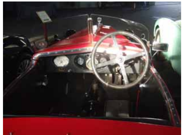
What a business-like cockpit !