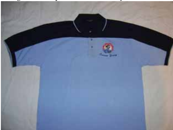
South Cape Golf Shirt