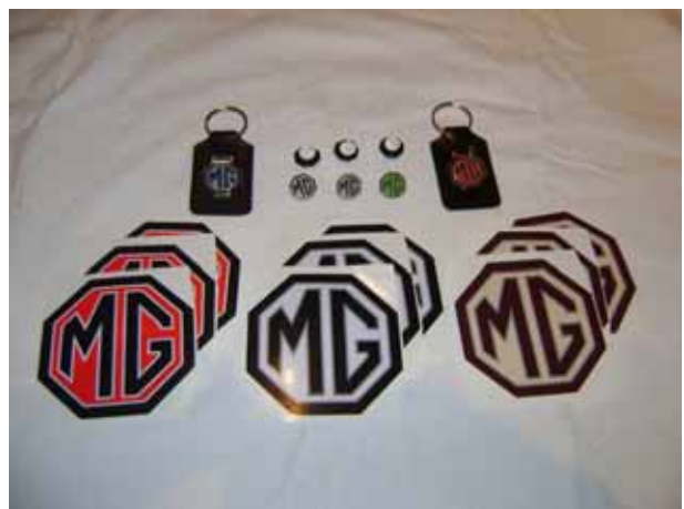
MG Key Rings and License Disk Stickers