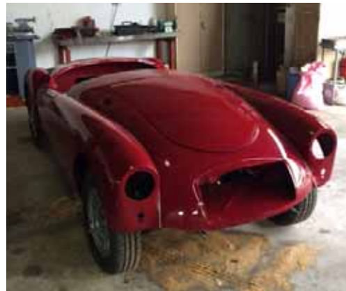
4 June 2015