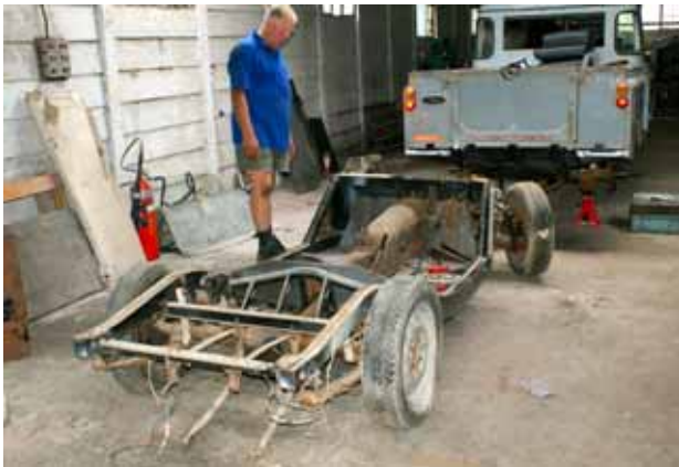
27 January 2015