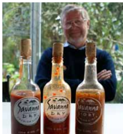
A choice between tomato, mild or hot Savanna!!