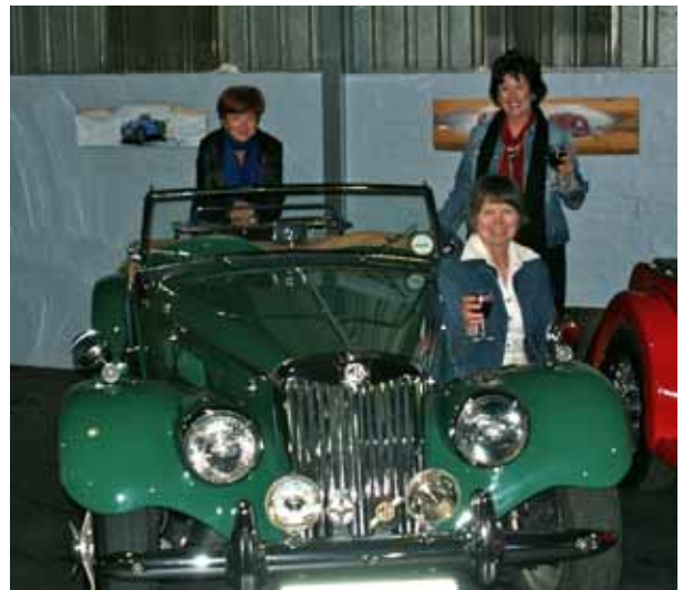
Four forms of art together in one photo - woman, wine, car and paintings.