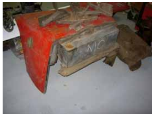
A very unfinished restoration ( M's Bulkhead)