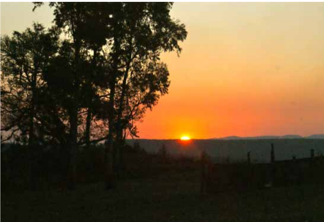
Sunset in Calderwood Hall where we stayed for two nights.