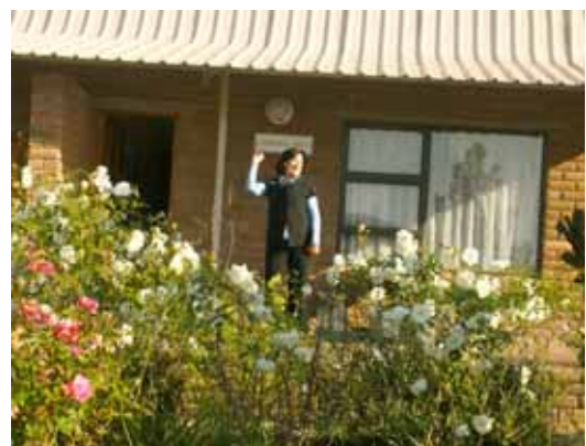
Second Night sleepover in Bethlehem.