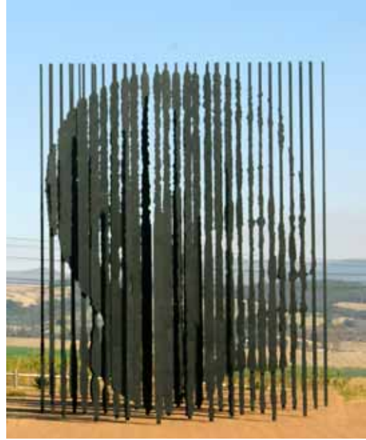
At the capture site of Pres. Nelson Mandela. Rather an amazing monument. Have to stand at a certain spot to see the spears form Mandela's profile.