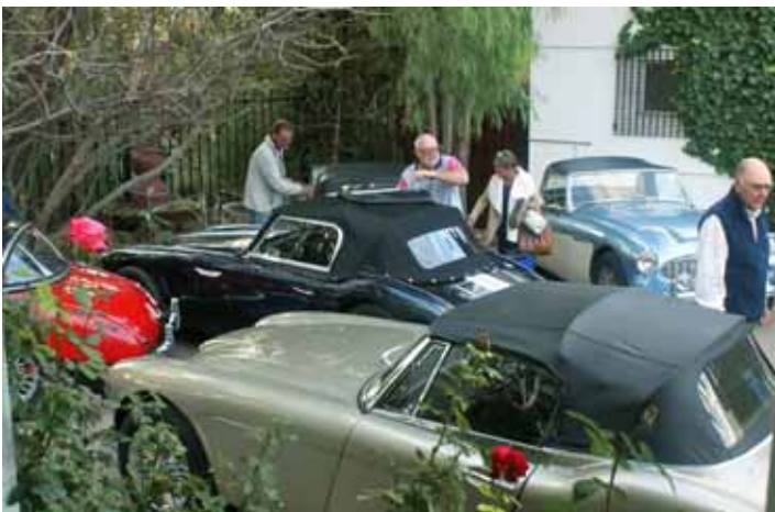
First Night sleepover in Colesburg.