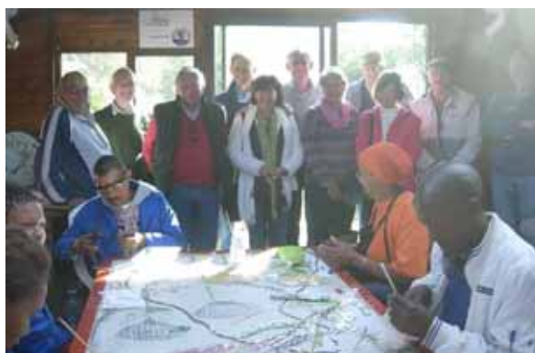
Inside the building - work in progress