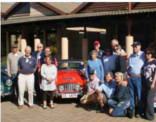
Group photo from the participants from Western Cape.