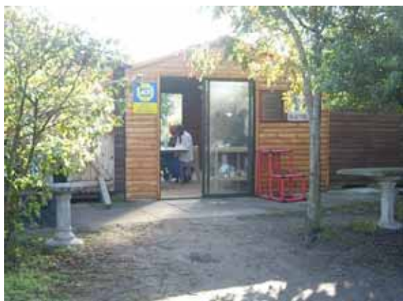
The mosaic centre building