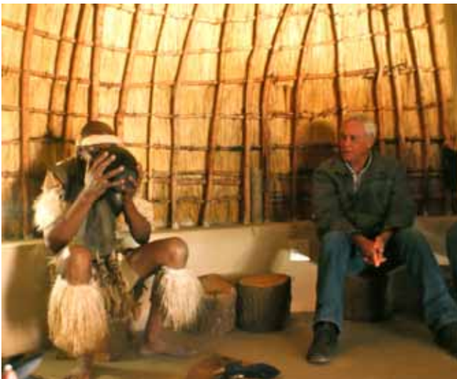
Zulu Culture Centre - all the men had a taste of whatever was in the kalbas. Men sat one side and woman on the floor the other side. Women's drink was non alcoholic and smelled like a mix of mieliepap and sour milk - only for the brave.