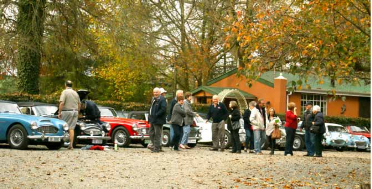
Arriving at Calderwood Hall