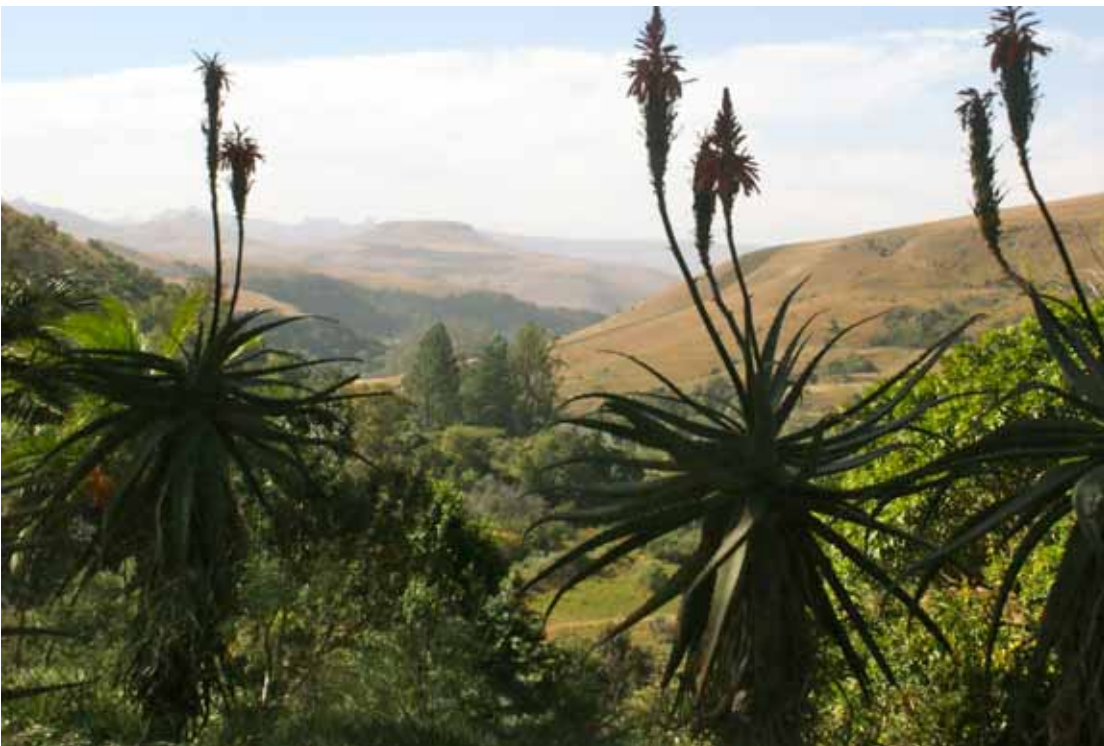
View in the Northern Drakensberg.

What more can I say than is not visible in the photos. We had great company, lots of great food and perfect weather. Just about 3000km there and back - I take my hat off for those traveling all that way in the Healey - well done.