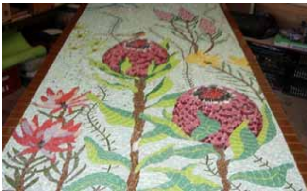
One of the large mosaic pannels produced