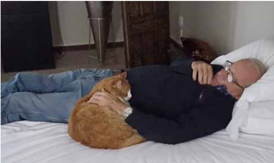
The start of the tour was very cat orientated.