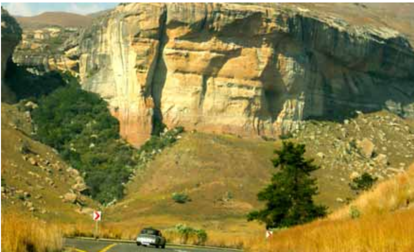
Golden Gate on our way to Calderwood Hall