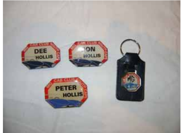
South Cape Name Tags and Key Ring