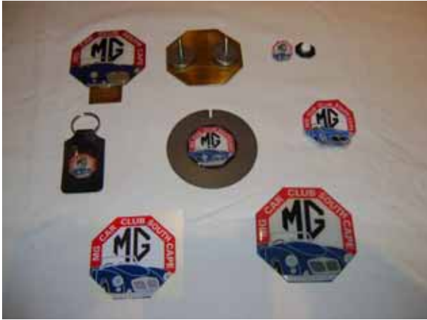
South Cape Bumper Badges, License Disk Holder, License Disk Sticker, Sticker, Lapel Badges