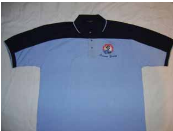
South Cape Golf Shirt