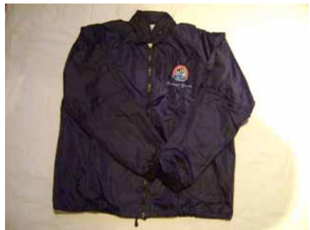
South Cape Wind Cheater