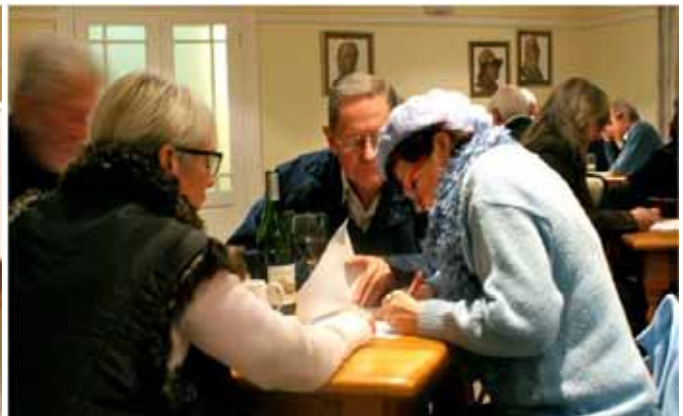
Winning team in action!