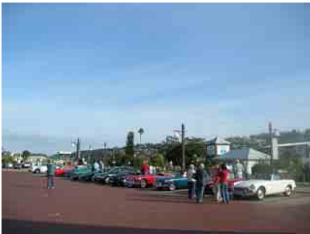
"At the Quays looking forward to breakfast."