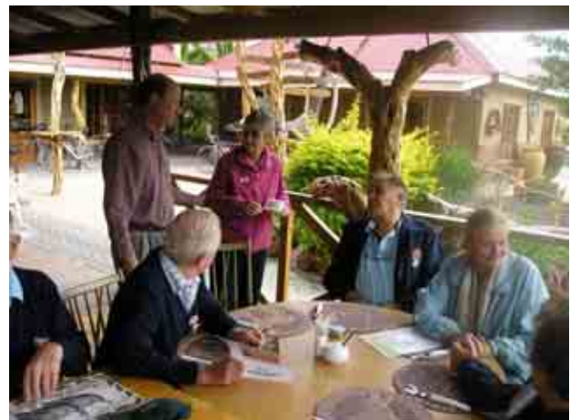
"Waiting for breakfast at Café Francois".

Another good turnout was treated to an excellent breakfast, competently and speedily served. Several MG members and their cars enjoyed the GRMC run to the Alpine Inn Restaurant in George and tummies returned laden with vast amounts of superb German cuisine.