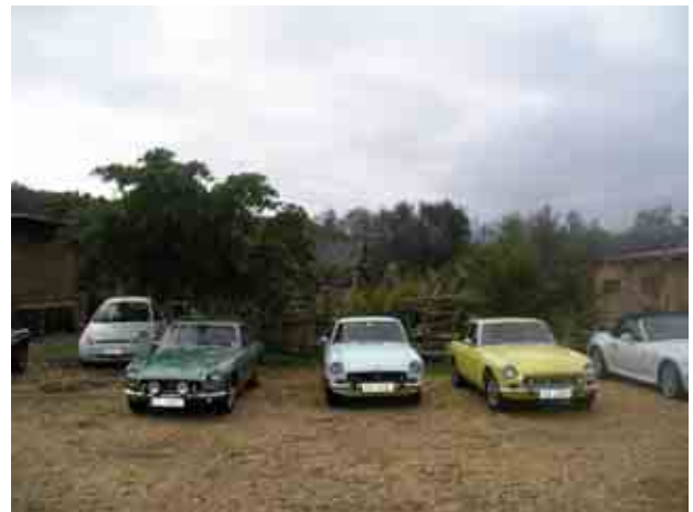
"A trio of Sedgies B GTs."