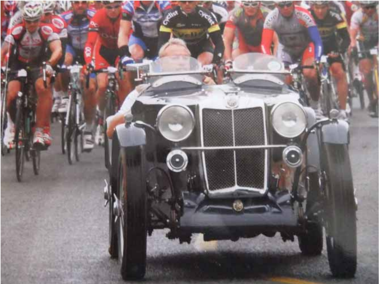
Hundreds of cyclists trying to catch up with unidentified M type Midget