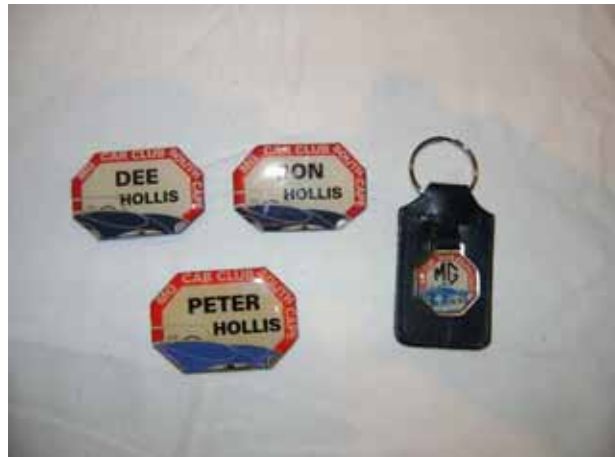
South Cape Name Tags and Key Ring