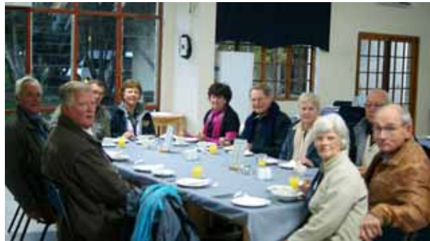
Final breakfast in Graaff Reinet before we hit the road back to Knysna

The first day from Knysna was wet and wet and wet but then the sun came out and the rest of the Tour was in lovely sunshine though rather cold early morning. Thank you to the organisers who really did plan a great tour and surely enjoyed by everybody.