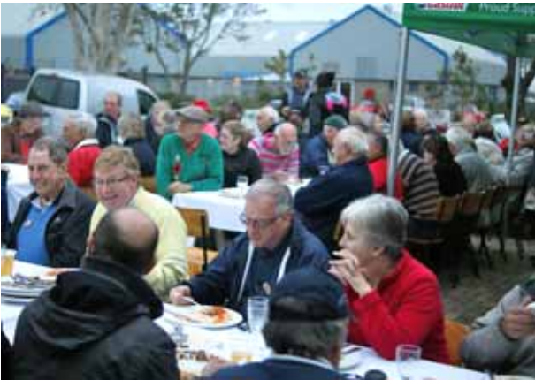
Curry Street Party Tuesday Evening