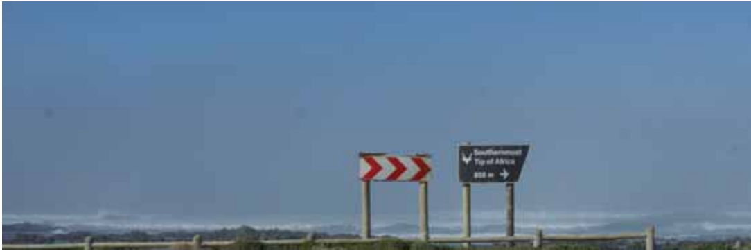
From Swellendam to Oudtshoorn via Cape Agulha