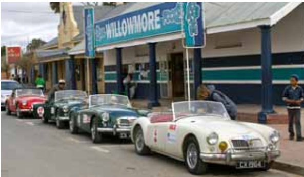
Then to Willowmore