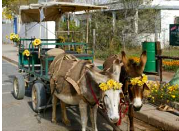
Willow limo or MG? Time for a teabreak on our way to Graaff Reinet