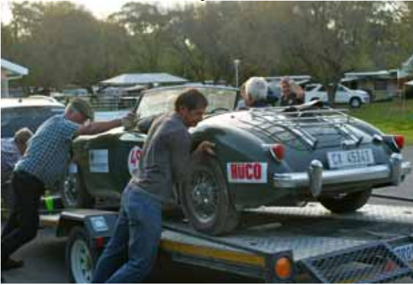
Arriving in Oudtshoorn - many hands make light work