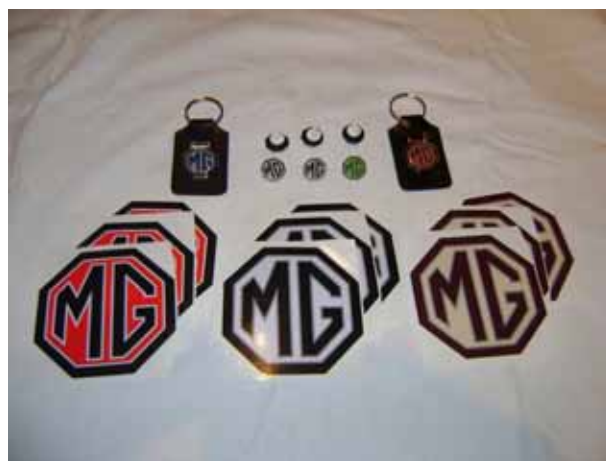
MG Key Rings and License Disk Stickers