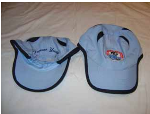
South Cape Cap