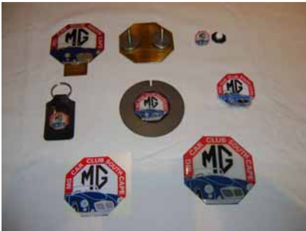
South Cape Bumper Badges, License Disk Holder, License Disk Sticker, Sticker, Lapel Badges