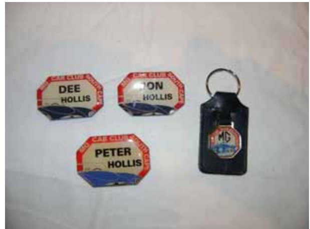
South Cape Name Tags and Key Ring