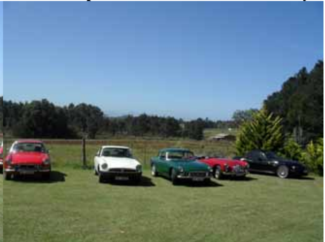
Bs, As and a BMW were present!