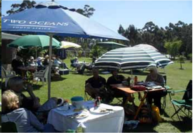
Umbrellas provided welcome shade on the day.