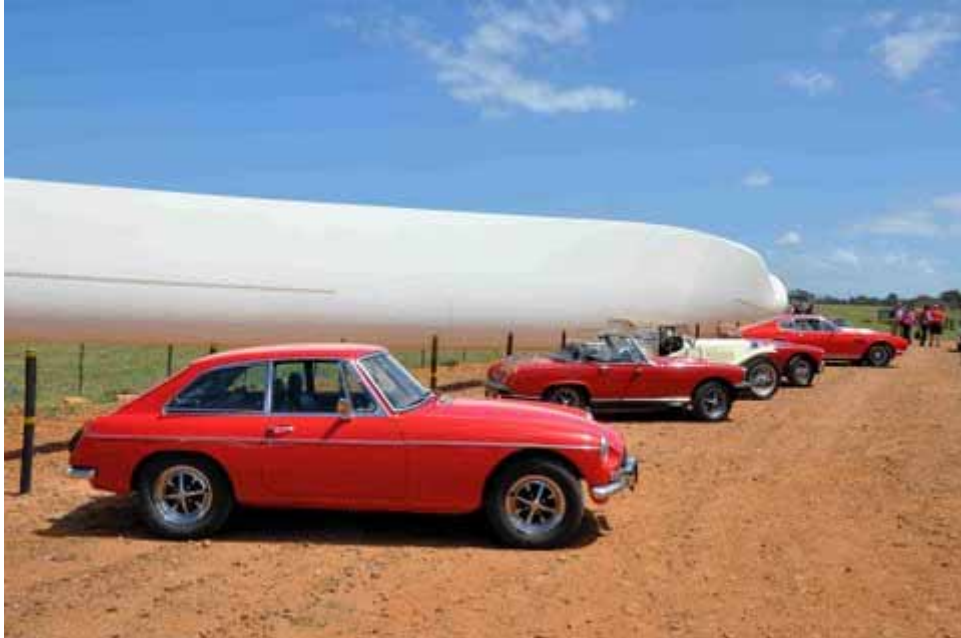
one blade of a wind farm windmill measuring 49m in length and dwarfing some of our cars

A supposedly light lunch (some of the dishes were decidedly ‘heavy’!) at Crossways punctuated the balance of the drive to Port Alfred. We spent the next three nights at the Halyards Hotel having dinner there the first night. On Tuesday, we were taken up the river by boat to the Mansfield game park where a short walk was followed by a braai. On returning to base, some went to a mohair ‘workshop’ and learned about the treatment and knitting of this wool. A group photograph was then taken in front of the local brewery before we drove to Guido’s on the beachfront for a quiz evening and supper. Wednesday was Bathurst’s day. We were given a chat about the history of the area at the Toposcope and then spent time at the Agricultural Museum which contained many items of historical interest relating to the early settlers.