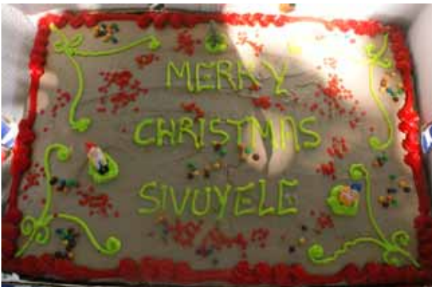
Schools nameboard with MG logo