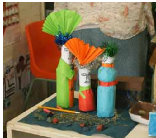
The three wise men made by kids