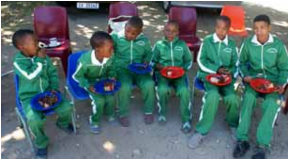
Children having treats .