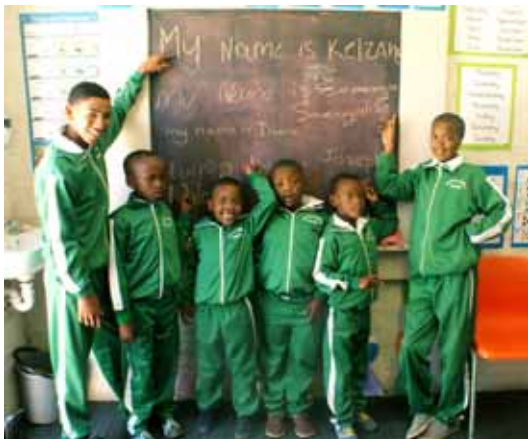
Schoolkids pointing to their names written on board