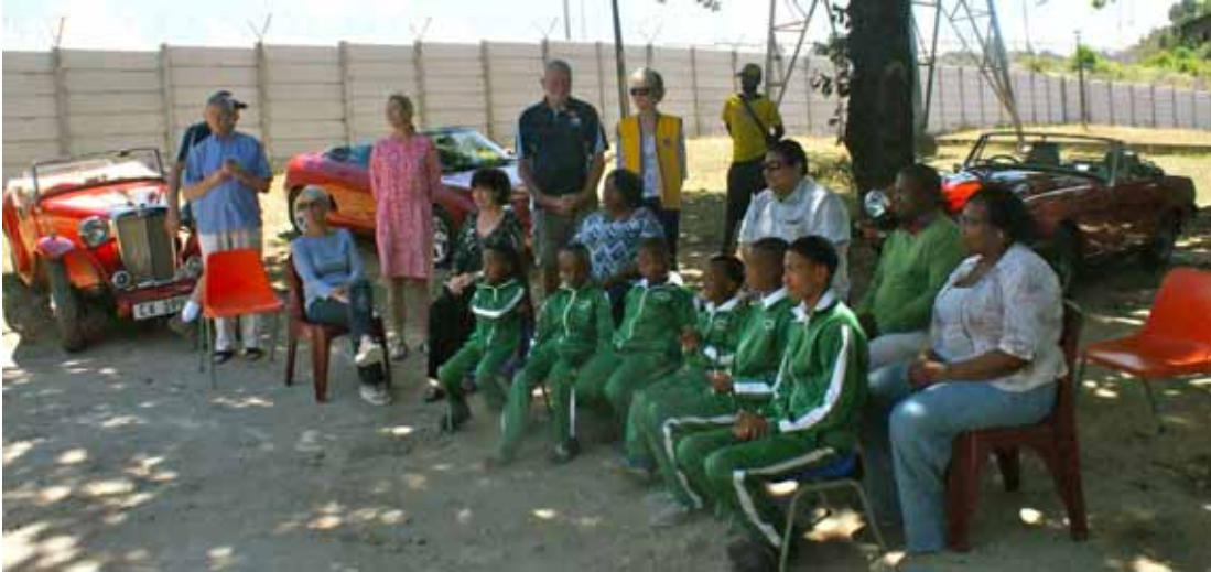
Three red MG's their owners and the children